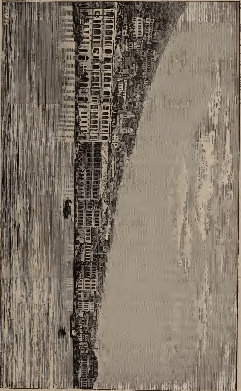
A SECTION OF HONG KONG.

that he should labor on the Sabbath, and also the parents for whose support he was obliged to labor. What should he do? Would it be right for him to work